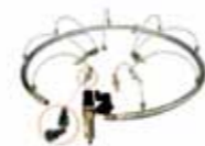
Cement Silo Fluidizing System