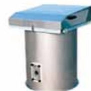
Cement Silo Filter (WAM)