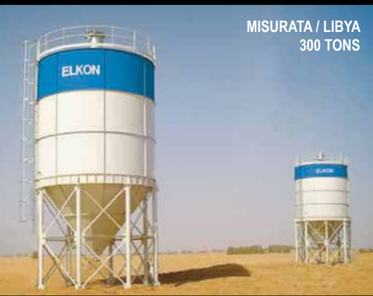
MISURATA / LIBYA 300 TONS