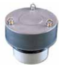
High Pressure Safety Valves