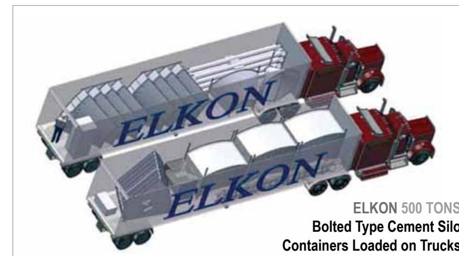
ELKON 500 TONS Bolted Type Cement Silo Containers Loaded on Trucks

Components for the bolted silos are produced using CNC laser cutting and drilling equipment to guarantee accuracy, before undergoing complete surface preparation and cleaning. The parts are manufactured under closely controlled conditions and undergo a final process on an overhead automatic conveyor system into a fully automated painting facility for priming and final coating. They are then packed in a predetermined process for transportation, to optimise freight requirements.