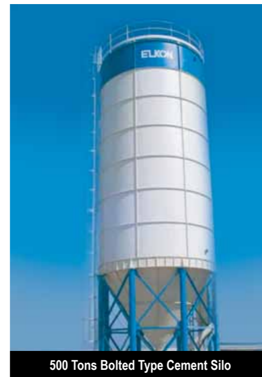
500 Tons Bolted Type Cement Silo