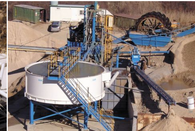
7 m Ø Clarifier in fine sand recovery process