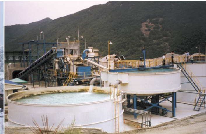
12 m Ø Clarifier and clarified water tank in sand washing process