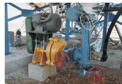
Sludge discharge system underneath the tank

Optionally, the tank may be supplied with an open bottom for installation on a concrete slab.