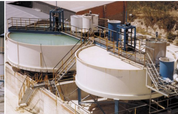
Kaolin treatment by 10 m and 8 m Ø Thickeners with rakes lifting system