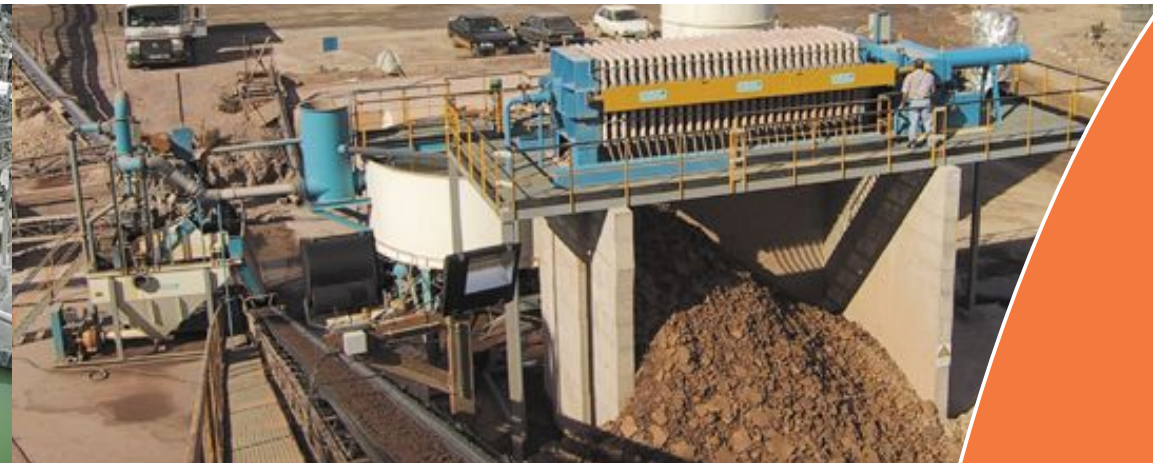
Integral treatment of effluent with solids in suspension