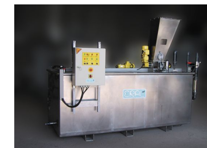
Flocculant make-up and dosing equipment

Effective flocculation and a high sedimentation rate call for a flocculant make-up and dosing equipment to automatically control the amount of polyelectrolyte (flocculant) added during continuous operation. This system comprises a hopper for the powdered chemical, a doser with an automatic variator, and preparation, ageing and decanting tanks with their respective electric stirrers. The entire stainless steel assembly features a dosage pump fitted with an electronic speed variator and electrical switchboard.