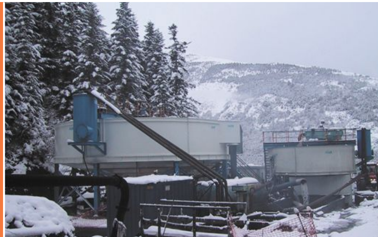
12 m and 6 m Ø Clarifiers in tunnel boring