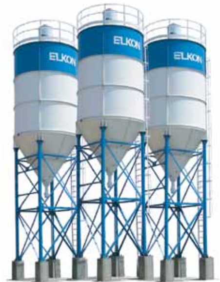
ELKON BOLTED TYPE CEMENT SILOS Capacities: 50, 75, 100, 150, 300, 500, 1000 Tons