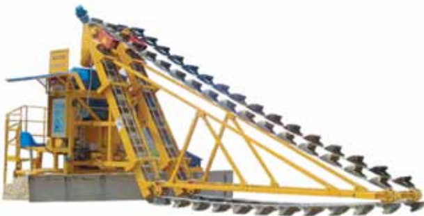
ELKOMIX – 16 Automatic Concrete Batching Plant with Double Elevators. Capacity: 8-10 m 3 /h