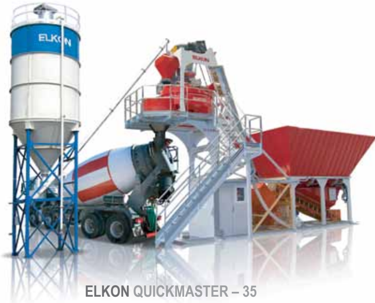
ELKON QUICKMASTER – 35 Concrete Batching Plant Capacity: 35 m 3 /h