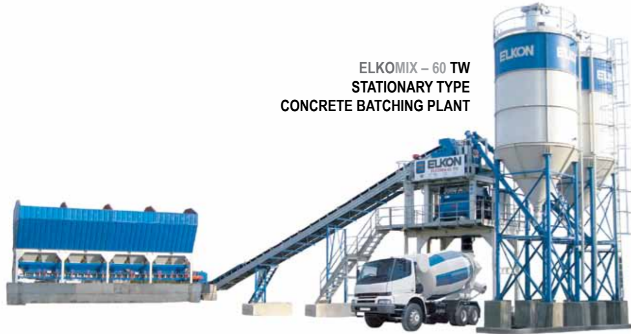
ELKOMIX – 60 TW STATIONARY TYPE CONCRETE BATCHING PLANT