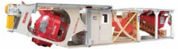
ELKON QUICKMASTER – 35 The main unit of the Elkon Quickmaster - 35 (without aggregate bunker panels) can be transported with only 1 unit 40' Open Top container