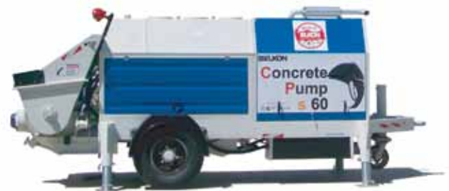
Stationary Type Concrete Pumps ELKOPOMP S45 / ELKOPOMP S60 Capacities: 40 m 3 /h, 60 m 3 /h