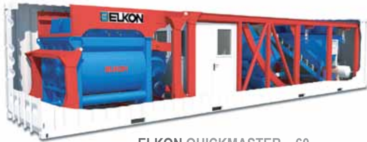
ELKON QUICKMASTER – 60 Concrete Batching Plant Capacity: 60 m 3 /h